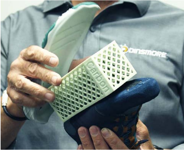
Reviewing material for Imre's shoe